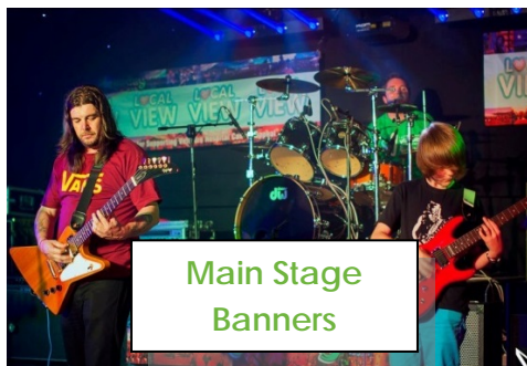
Main Stage Banners