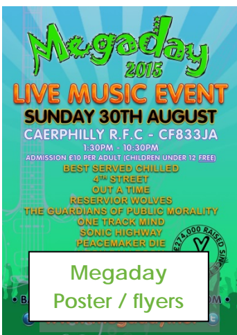
Megaday Poster / flyers