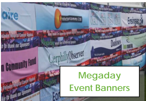
Megaday Event Banners

Megaday is a non profit making organisation run completely by volunteers. It is only made possible by the time, efforts and generosity of local people and businesses, we would love you to get involved. If you're interested in sponsoring this year's event, please do get in touch. Here are the sponsorship packages available and details of how to book them ☺